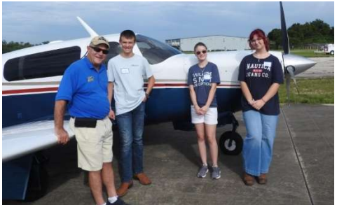
All YE photos courtesy of Ted Luebbers